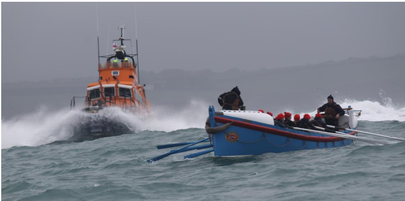
The re-enactment of the Courtmacsherry Lifeboat call to the RMS Lusitania