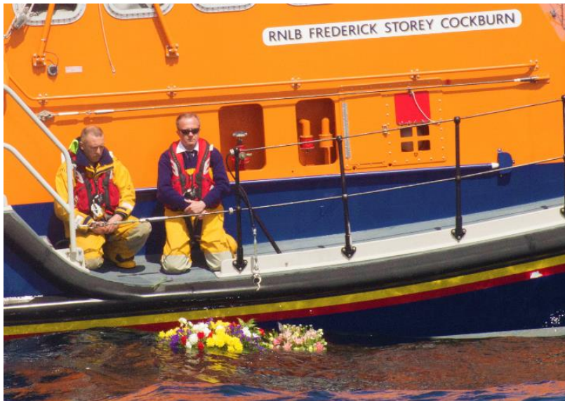
Courtmacsherry RNLI: The keepers of her final resting place.