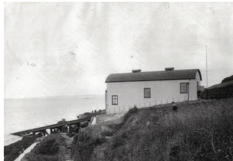
The old Courtmacsherry RNLI Station at Barry's Point.